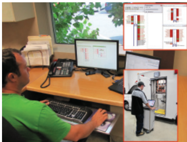
Demers field service coordinator providing assistance via remote Multiplex CyberLink to a customer service technician.