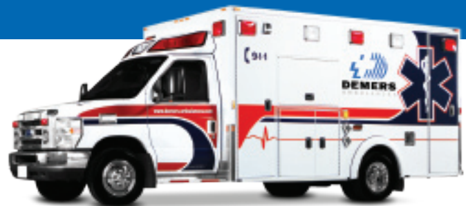
MYSTERE MX 170S TYPE III

In fact, Demers is the only manufacturer that can remotely access the customer's Multiplex system in his ambulance to diagnose, download and repair the system if necessary.